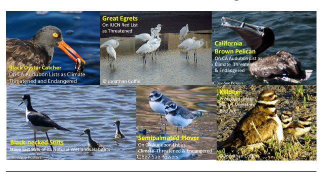
Some Ballona Winter Neighbors