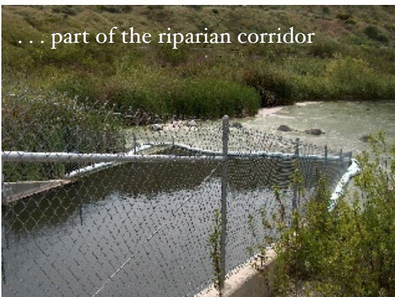
. . . part of the riparian corridor

WHAT IS A DONE DEAL? Wall Street, Union Bosses, Corporate Lobbying and Gaming with a staggering and never ending cash flow from campaign contributions, behests and favors to politicians (both parties), corporations and unscrupulous individuals.