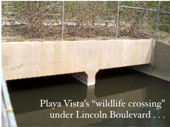
Playa Vista’s “wildlife crossing” under Lincoln Boulevard . . .

“Before the vote, Koretz asked about mitigation being undertaken to deal with the property’s methane seepage issues, and wanted to know whether simple extra measures could be taken to protect the area’s extensive wildlife from being harmed by Playa Vista traffic. ‘I couldn’t get a straightforward, thoughtful answer,’ he says, ‘because it was so much of a done deal. They knew they had the votes.’” Tibby Rottman LA Weekly.