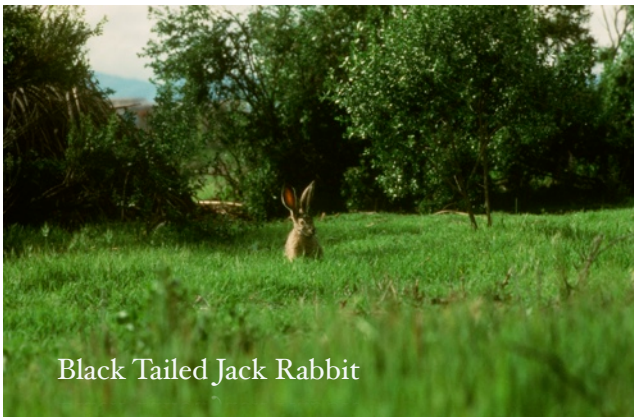
Black Tailed Jack Rabbit

“The immense diversity of the insects and flowering plants combined is no accident.