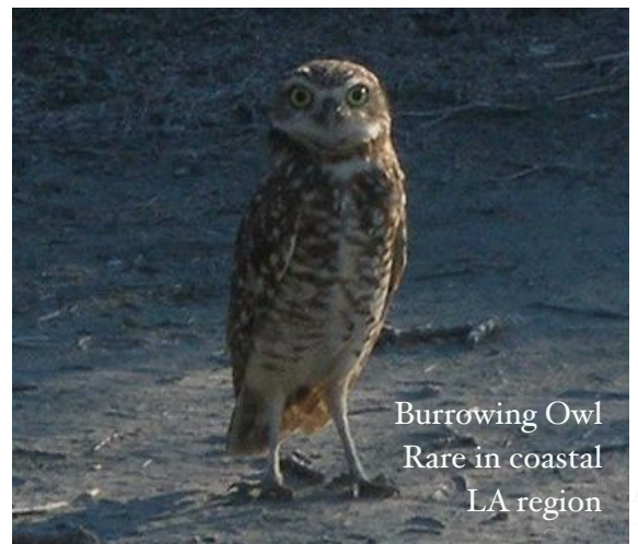
Burrowing Owl Rare in coastal LA region